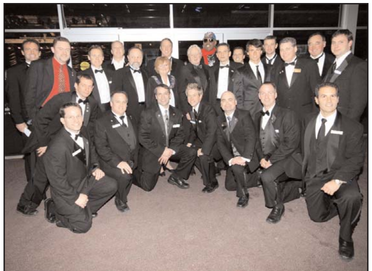
Halifax Progress Club members with Celebrities