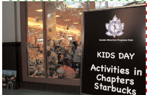
Children having lots of fun with the window painting