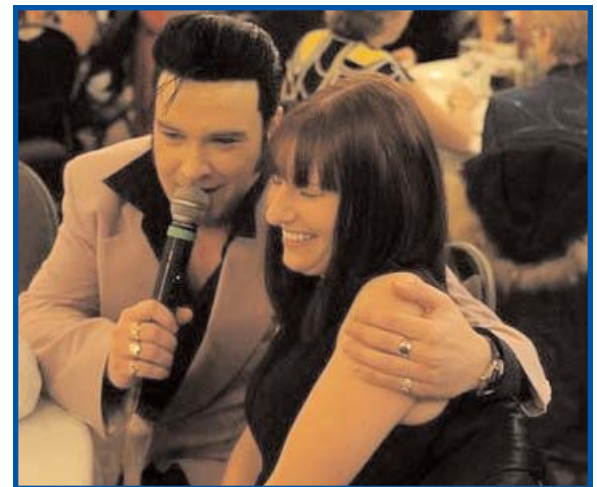
Elvis wooing the ladies.....adding to a fun night of dancing, great food and fund raising.

From all the reviews it is clear that this is an event everyone will be marking next year's calendar for right now.