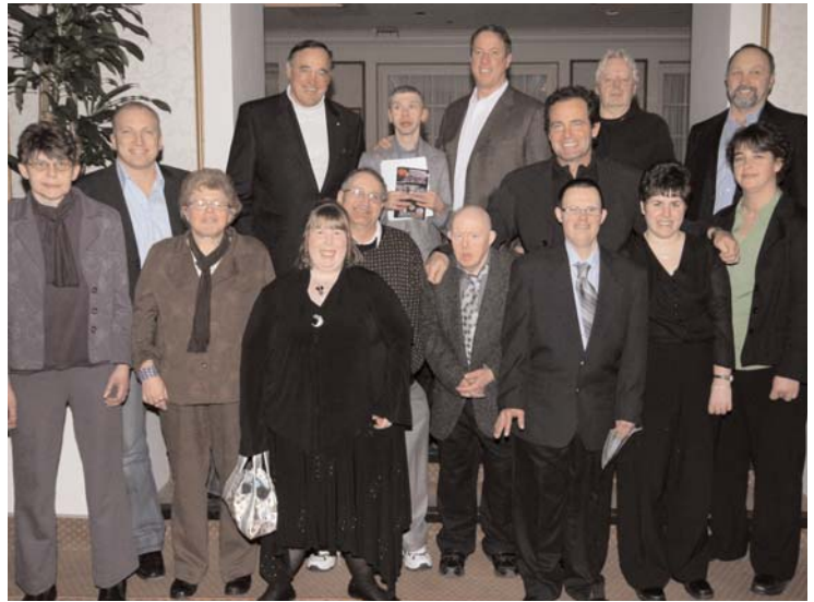
Kingsmeadow Residents with Celebrities