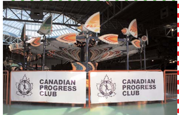
Progress Club Kids Day at Crystal Palace