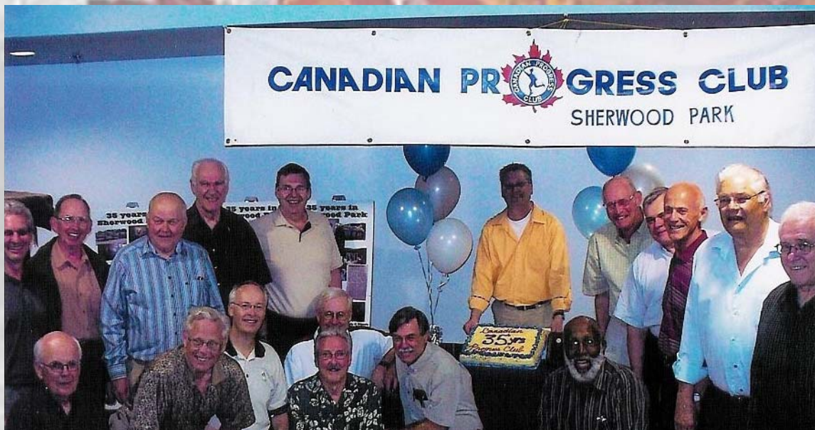
Picture of current and past members of Sherwood Park attending the 35 year celebration

The Canadian Progress Club Sherwood Park celebrated 35 years of service to the community. To mark the occasion invitations were sent out to past members who still live in the county of Strathcona to attend our annual charity auction. The attached photograph shows all those who were present as we cut our 35 year cake.