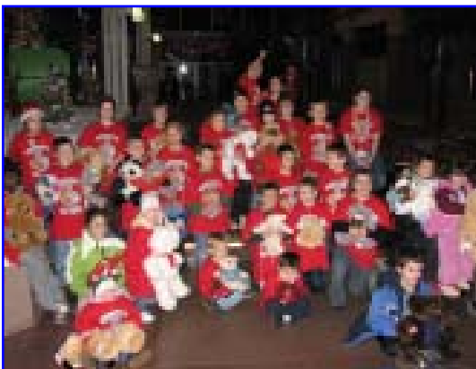
Moncton Kids enjoying attending the Pedway event

Their antsy little frames popped up and down with excitement as they enjoyed the festivities while watching the floats pass directly under their feet. To stand back and view the whole thing from one end of the Pedway made you nod your head and think "This is what it is all about". For at least a short period of time these kids had forgotten about all the hurt in their lives and were enthralled in a festive atmosphere of joy. If there was ever any question about why we do this, why we put in all the volunteer time and effort, the smiles on their little faces said it all.