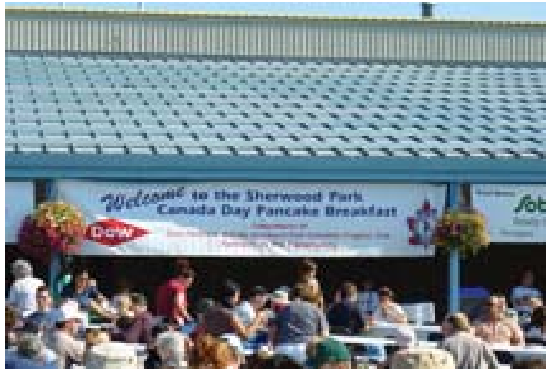
Cross section of the large crowd that was served.

For more than 25 years the Canadian Progress Club Sherwood Park has been hosting a pancake breakfast on Canada Day. This function is held at Broadmoor Lake Park and attracts more than 3000 persons every year. For the last two years we have used the day to end a loonie drive which held by placing coin boxes at merchants in the county from May 1st to Canada Day to raise funds to help meet children's needs