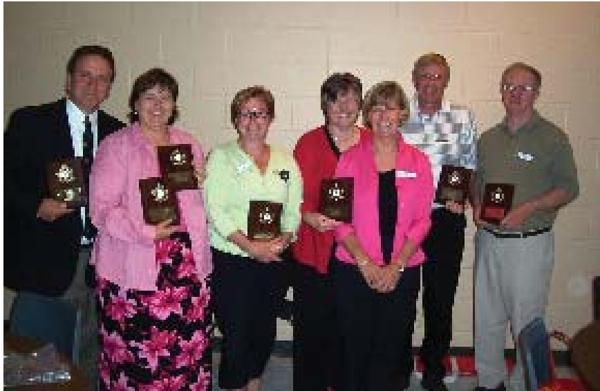
Central Region Award Winners