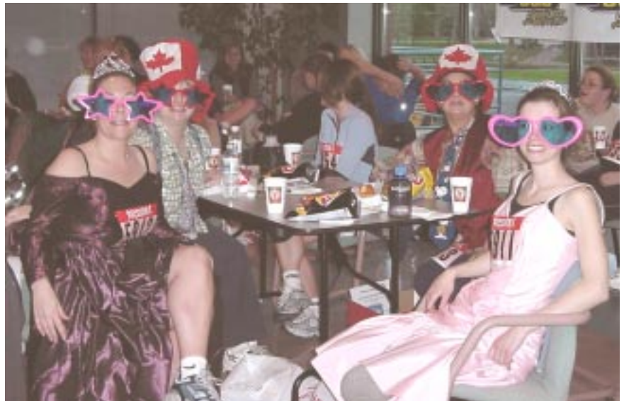
Some of the participants in the 2004 Runaround. One of the categories for prizes is Best Costume, which brings out the creative streak in a few