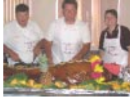
Volunteers from the Pork Board carve the beast

second to none. A class act from start to finish. Wow! Seconds anyone?