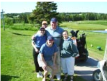
Great West Life volunteers pose with golfer

After the tournament the Memramcook Institute was in fine form hosting the banquet. The institute employees and the Canadian Pork Board combined efforts and once again served up the roasted pig and put on a spread