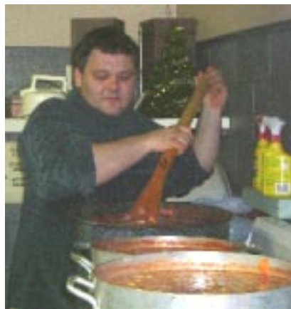
The big boy stirs the big pot.

Once a month you can be guaranteed to see this big man, ladle in hand, stirring up a hearty pot of generosity. Putting out one thousand bowls of soup in a night won't solve the problem of world hunger, but is sure helps out locally. Heading up this committee he allows Progress members to bring a sense of community into their lives. The soup goes out on "Mobile One", Moncton's