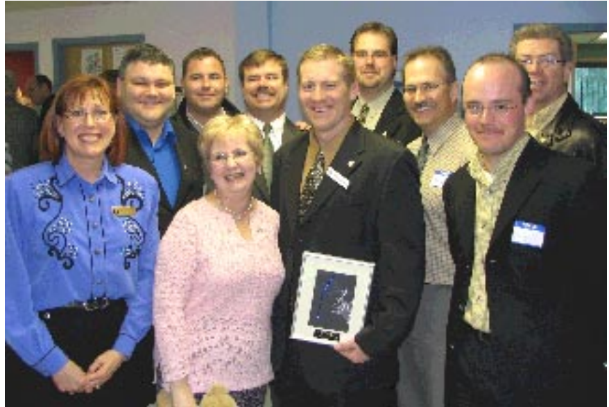
Moncton Progress Club receives a Thank You for their contributions.