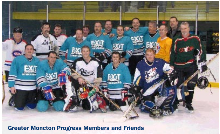
Greater Moncton Progress Members and Friends

At any given Moncton Progress event it is not unlikely to see a number of members doing what