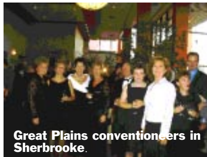
Great Plains conventioners in Sherbrooke.