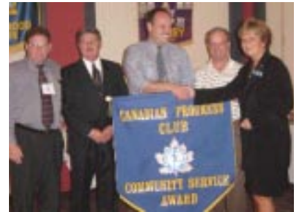
Community Service Award Winners, Calgary North