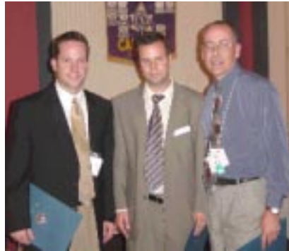
Mentor Awards, Halifax