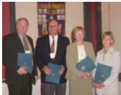
Mentor Awards Central Region