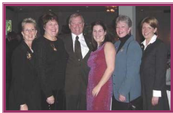
Halifax Cornwallis in Moncton

A good time was had, by all reports. On behalf of Halifax-Cornwallis: a great big WELCOME to the women of Moncton!