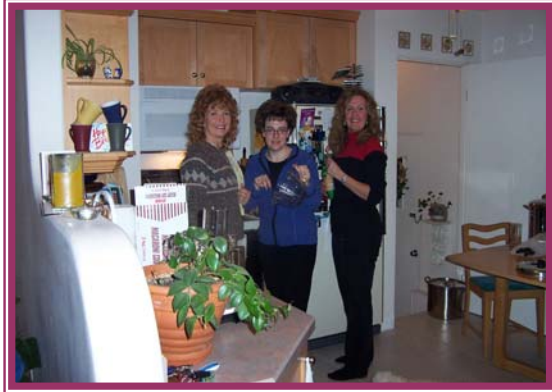
(Regina Assiniboine members work together to address the continuous need for nutritious soup to feed hungry families in the core area of the city)

Members look forward to continuing their support of another inner-city agency, by providing an ongoing supply of soup to the Carmichael Outreach Centre. This organization feeds the hungry in the core area, with the assistance of CPC Regina Assiniboine's own version of Stone Soup—the Chop N' Chat soup-making nights held at members' homes throughout the year.