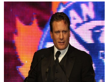
Jeremy Roenick Delivering His Speech