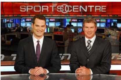
Jay Onrait & Dan O'Toole