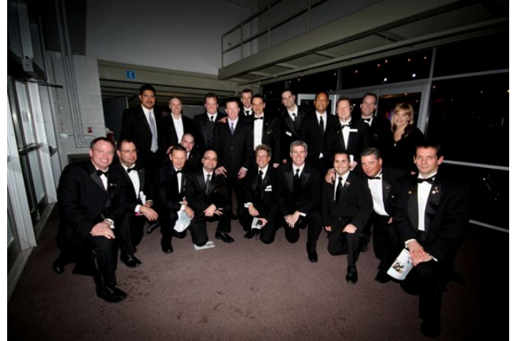
Committee, Celebrities, Head Table Guests